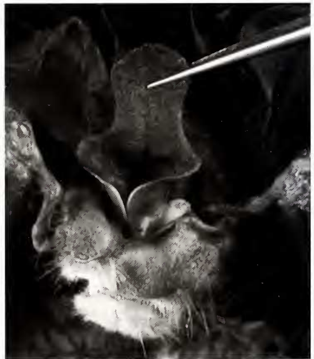
Fig. 5. Partial noseleaf and sella of the holotype (FMNH 219793) of Rhinolophus kahuzi sp. nov.

Diagnosis. Immediately recognized as a part of the Rhinolophus maclaudi species group (Fahr et al. 2002) due